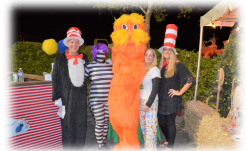
The Dr. Seuss themed costumes were the best. But it was the Lorax who stood out from the rest!