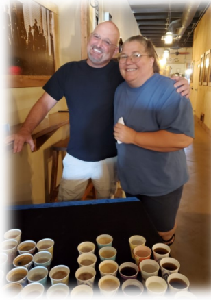
Smoking Cannon Brewery provided up to three tastings during the event. Tasters could try any of their beers, sodas or nitro coffee. Marinade on Main also supplied a yummy French toast dessert. It was delicious.