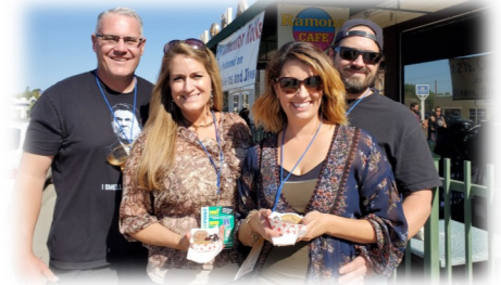
Tasters enjoyed the event with desserts from the London Bakery!