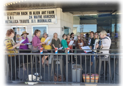
Ramona Community Singers sing tunes outside of Old Town BBQ providing entertainment to tasters.