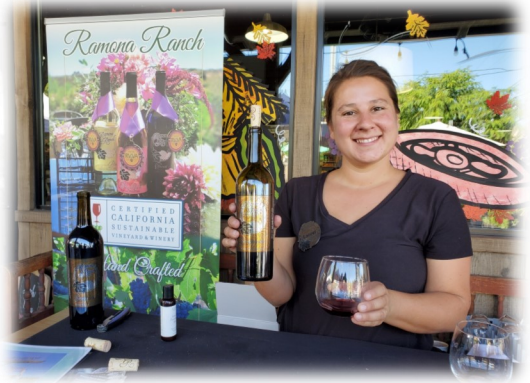
Ramona Ranch Winery paired with Ramona Family Naturals.

The 5th Annual Taste of Ramona proved to be the most popular chamber event once again this year. We broke our event sales record by selling out of tickets a week before the event and had a waiting list of over 30 people looking for any remaining or returned tickets. With over 20 participating locations, those who had tickets were stuffed with delicious foods, desserts and beverages. Some of the favorite food tastings participants raved about were the wine and Cheese from the Cave pairings at Pamo Valley Winery, the Turquoise Barn Cider pumpkin float dessert, and Boll Weevil's pickled fries. New eateries such as Graham's Retro Diner, Wasa Sushi and Valencia's Crem de la Crem benefited from the event exposure. The event raised over ten thousand dollars for our nonprofit organization, which helps fund next year's educational grants and scholarship programs.