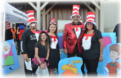
Here is a family dressed up as cats. They had the best group costume with matching hats.