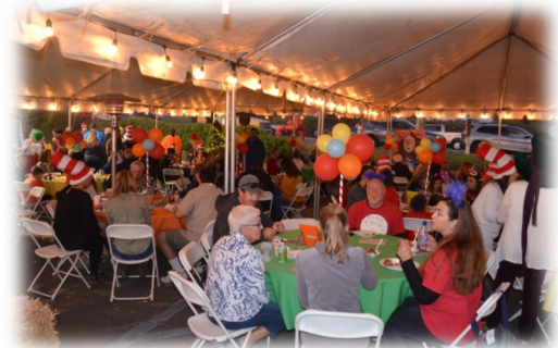
Members and guests filled up the event. Everyone would agree the networking mixer was time well spent.