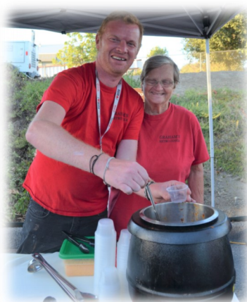
Graham's Retro diner brought something new. The usually make burgers but now they have chili too!