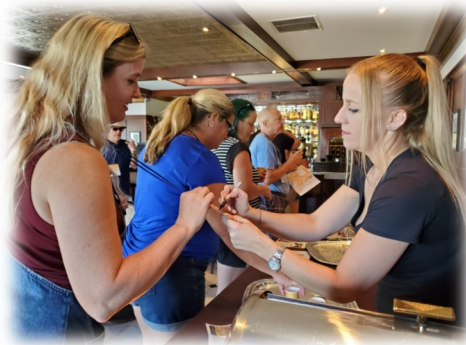
The Main Course Restaurant served lobster bisque, clam chowder and wine from Milagro Winery.