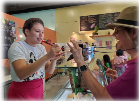
Valencia's Crem de la Crem was a new participant allowing tasters to see their new location and try their authentic homemade ice cream.