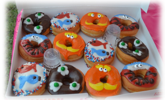
Dunkin' Donuts frosting themes were so great. Donuts were so good they didn't last long on a plate.