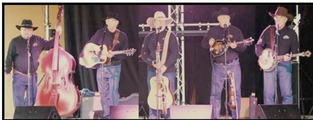
Shirthouse Band Bluegrass, Country & Southern Rock