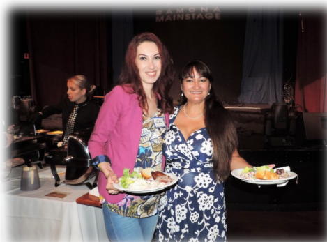
Bee Bee and Lili enjoy food from Ramona Old Town BBQ.