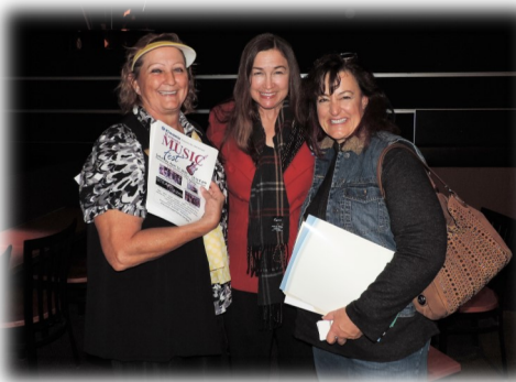
Chambers members promote the Ramona Music Fest.