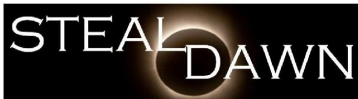
Best Current and Classic Rock & Roll