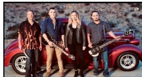
Flathead Sixx Classic and Southern Rock

Beer - Wine - Food - Auctions - Raffle - Hourly Door Prizes Large Kid Zone - VFW Auxiliary SWAP Meet in Parking Lot (Free admission)